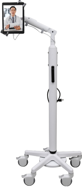
Tablet Stand C1