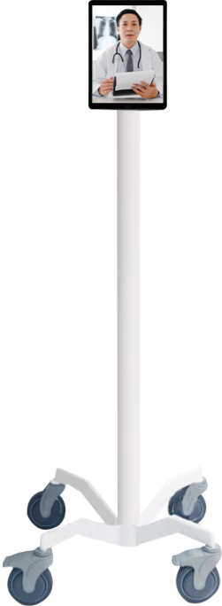
Tablet Stand C2